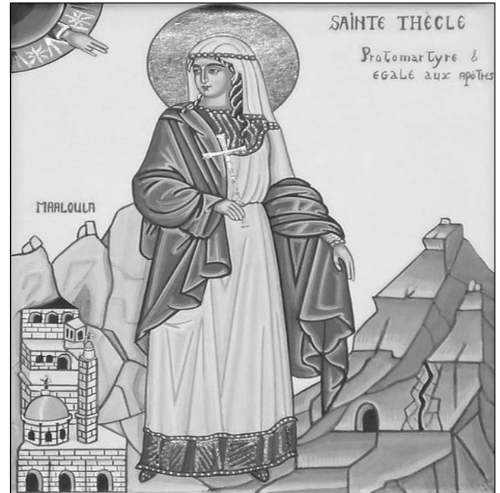
The Proto-Martyr Thekla, Equal-to-the-Apostles

Shortly after her death a community of virgins went to live in her mountain cell, building a small chapel to en-shrine her body. This Convent of Saint Thekla still exists today near the village of Ma'loula, Syria.