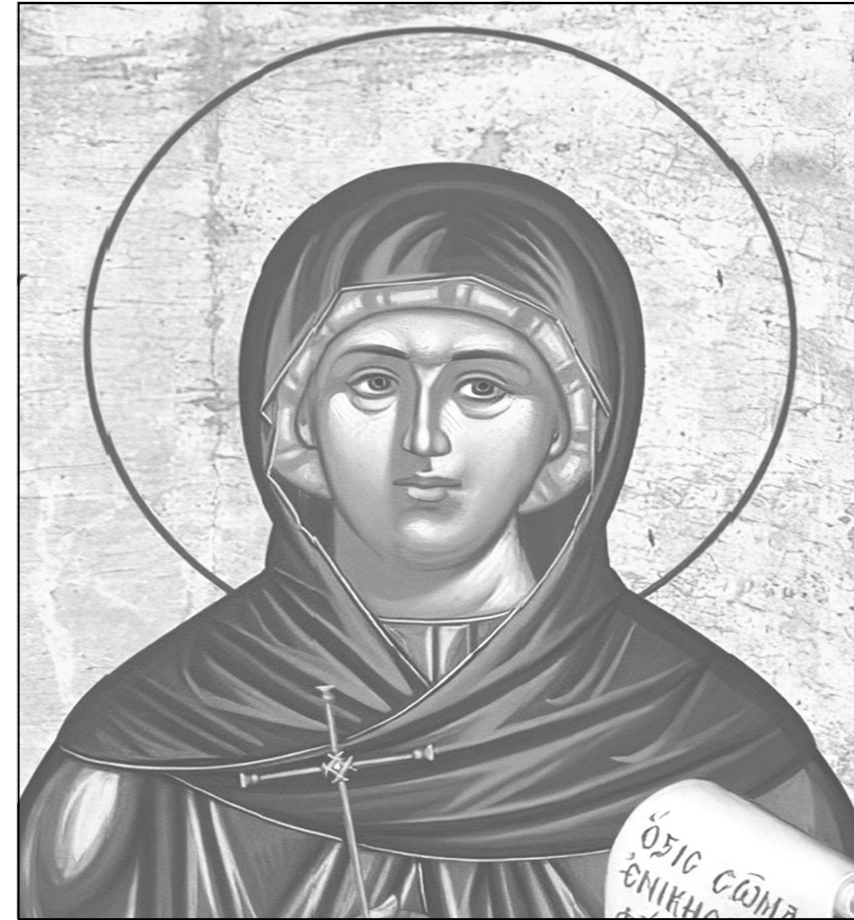
+Righteous Mother Pelagia, the Penitent of Antioch

When Bishop Nonnus, in the company of other bishops, first saw the sinner Pelagia in her outward splendor-clothed in the most expensive garments, adorned and be- decked with rings, necklaces and baubles, perfumed, and surrounded by slaves- Bishop Nonnus began to weep, and said to his companions: "In truth, I have learned much from this woman. The Lord will set her before His Dread Judgment and will rebuke us through her. How many hours does this woman spend in her room bath- ing herself, clothing herself, adorning herself, and looking at herself in the mirror- and for what? Only to appear more beautiful to men. And we, who have the immor- tal Bridegroom in heaven, do not strive to adorn our souls with repentance; we do not hasten to bathe them with the tears of repentance and clothe them in the beauty of the virtues, that they might appear more beautiful before the eyes of God!"