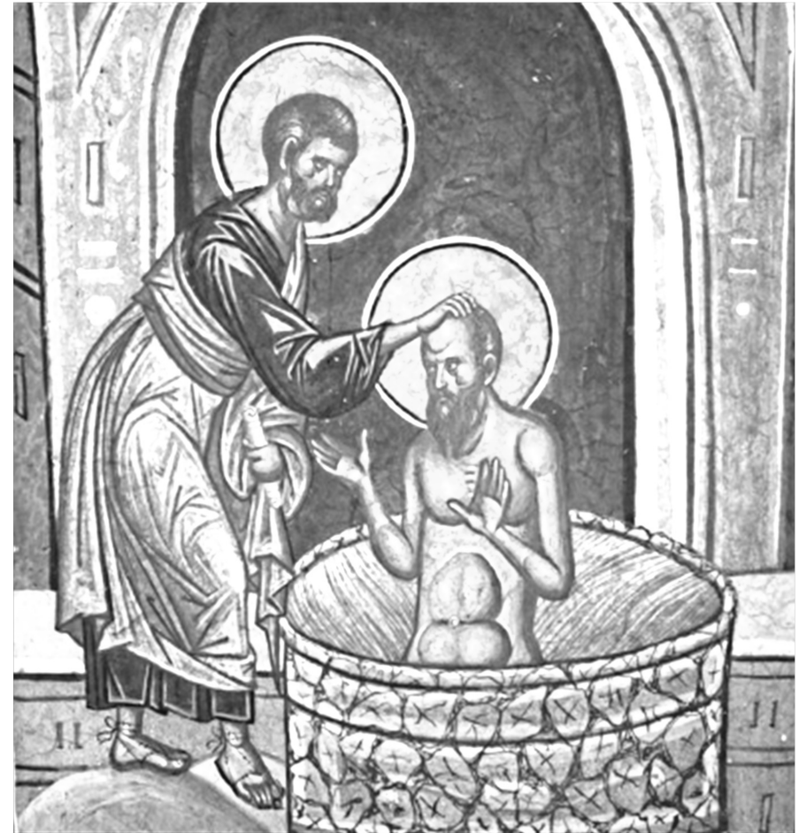
The Baptism of Saul (Apostle Paul) by the Holy Apostle Ananias of the Seventy